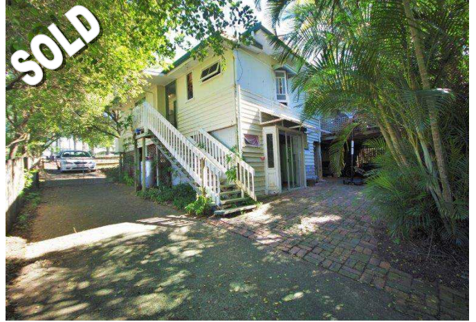
25 Main Street, Palmwoods