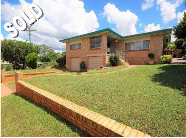
1 Bambaroo Close, Nambour