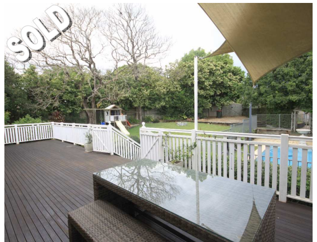
12 Elizabeth Street, Nambour