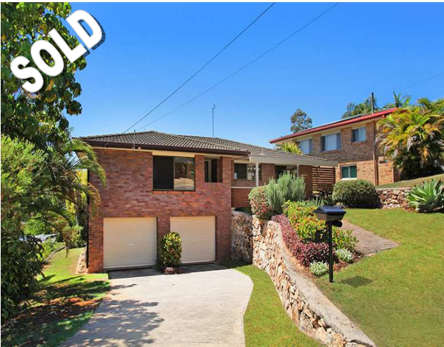
7 Sue Street, Burnside