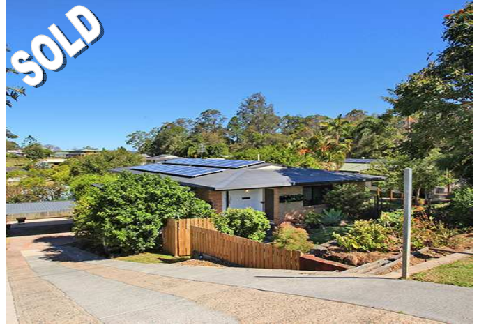
169 Coes Creek Road, Coes Creek