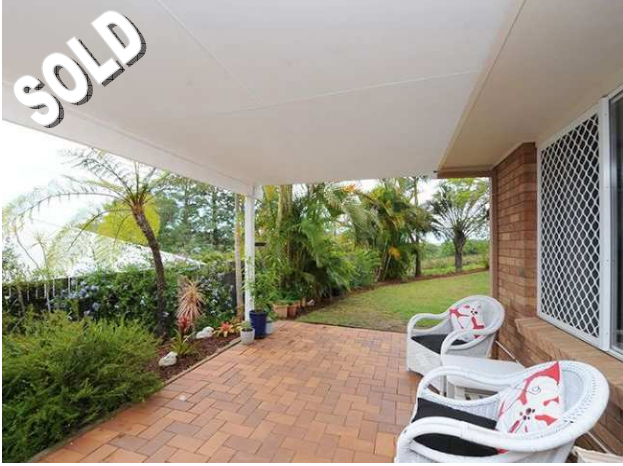
137 Coes Creek Road, Coes Creek