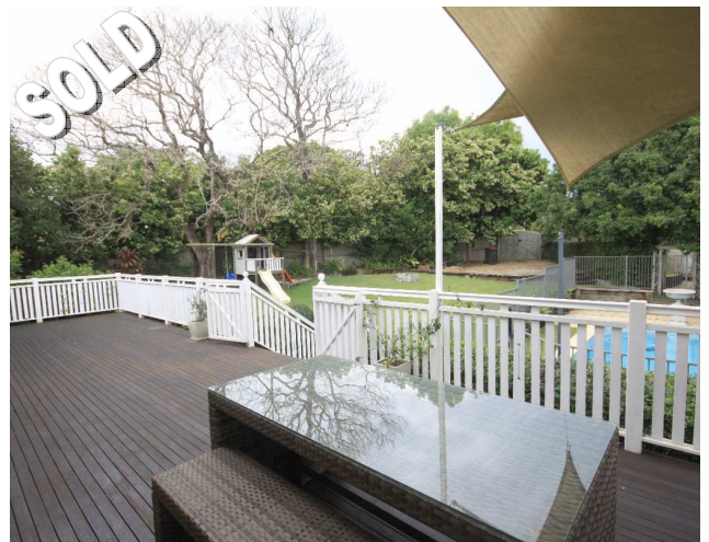
12 Elizabeth Street, Nambour