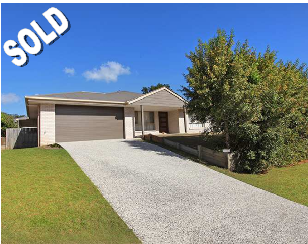
7 Killarney Crescent, Nambour