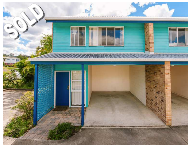
18 Solandra St, Nambour