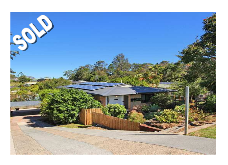
169 Coes Creek Road, Coes Creek