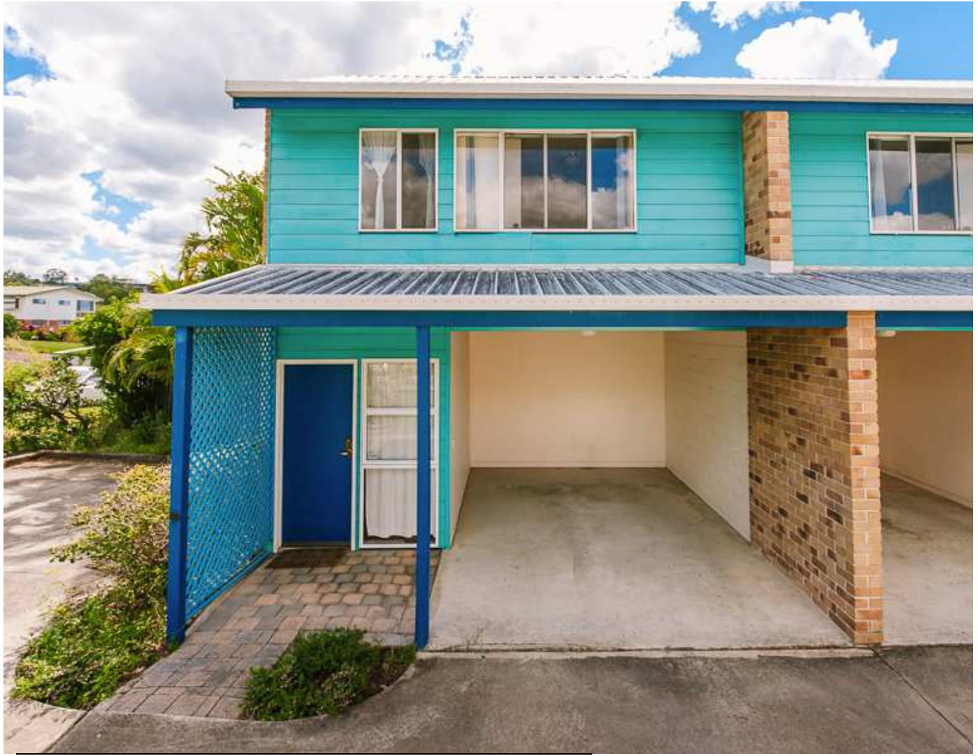
SUPER STARTER—GREAT INVESTMENT OPPORTUNITY