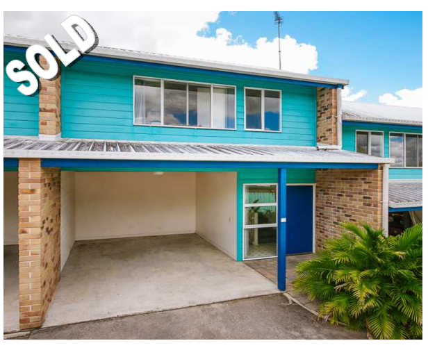
2/8 Solandra St, Nambour