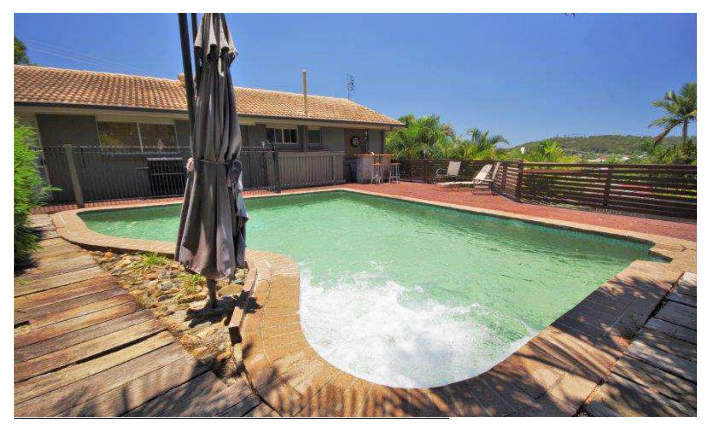
BIG ON VALUE * SOLID HOME * FABULOUS YARD * BIG POOL * VIEWS