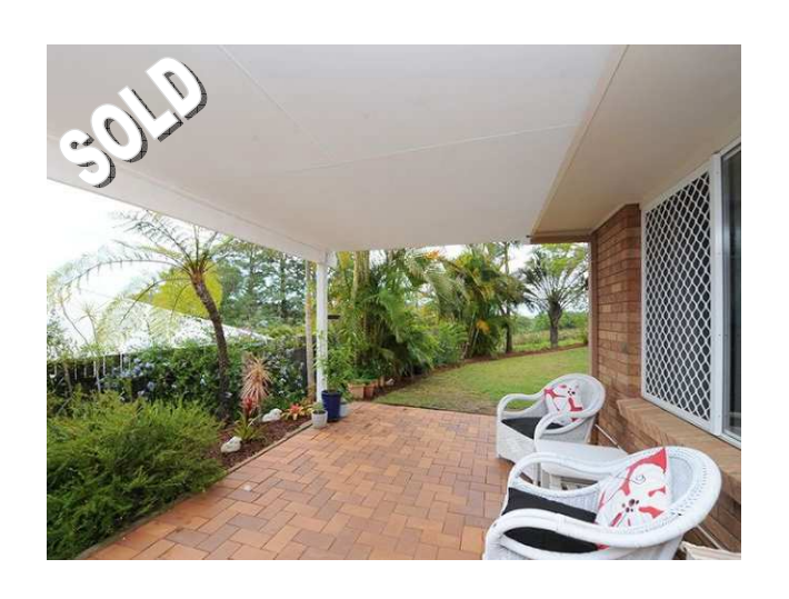
137 Coes Creek Road, Coes Creek