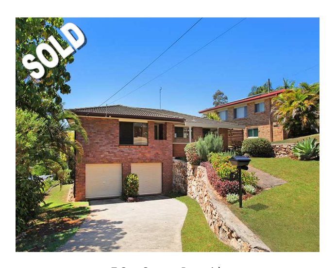
7 Sue Street, Burnside