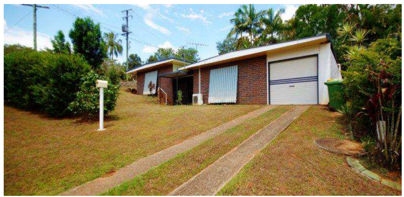
1 Inglewood Court, Palmwoods $345,000

HARD TO FIND AT THIS PRICE IN PALMWOODS CENTRAL! CUL DE SAC LIVING-NEAT BRICK HOME 600M2 + LAND SIZE-WALK TO SHOPS