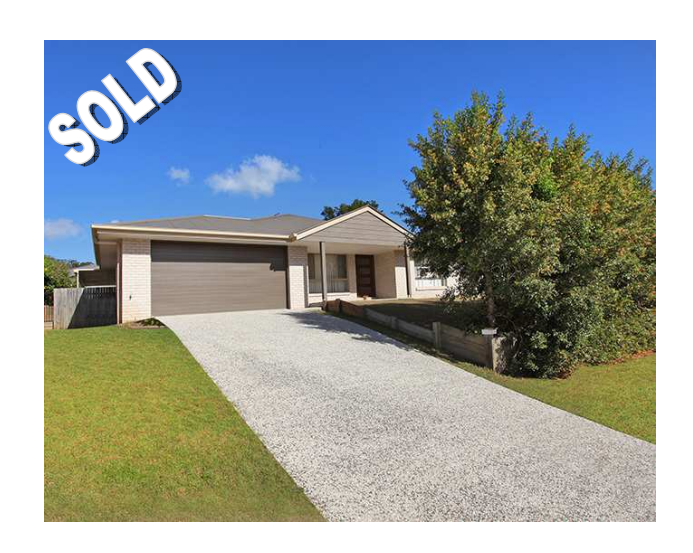
7 Killarney Crescent, Nambour