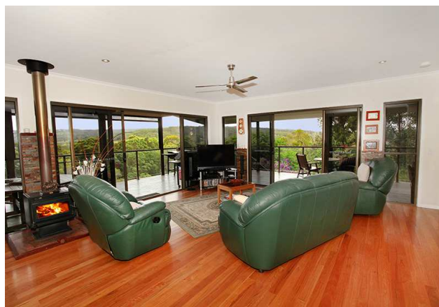
26-30 Shamley Heath Rd, Kureelpa $649,000