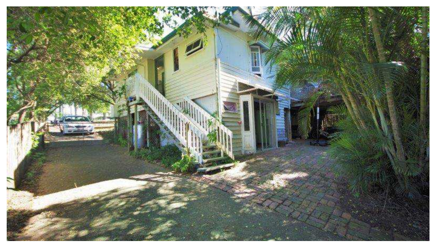
TOWN CENTRAL CHARMING QUEENSLANDER GREAT YARD