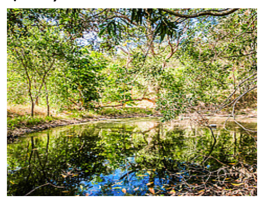
82 Collins Road, Ninderry $590,000