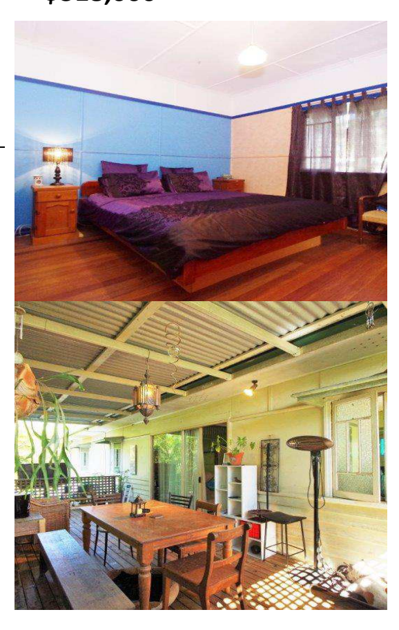
25 Main Road, Palmwoods $318,000

ELDERS ID 9684170 STEVE MILLER 0414 780 289