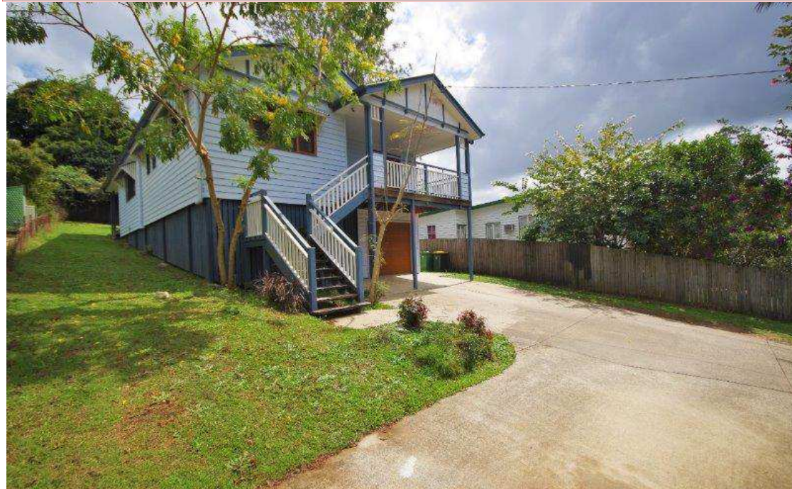
PALMWOODS—19 Jubilee Drive