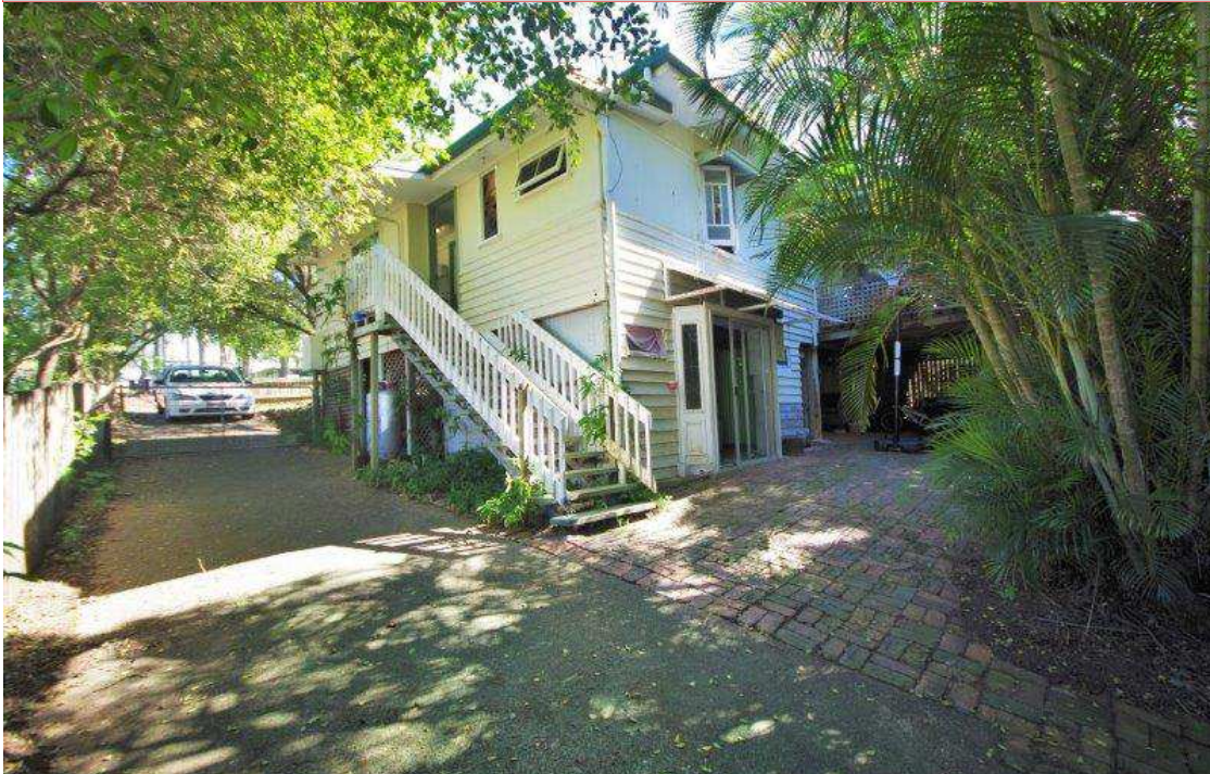
PALMWOODS— 25 Main Street