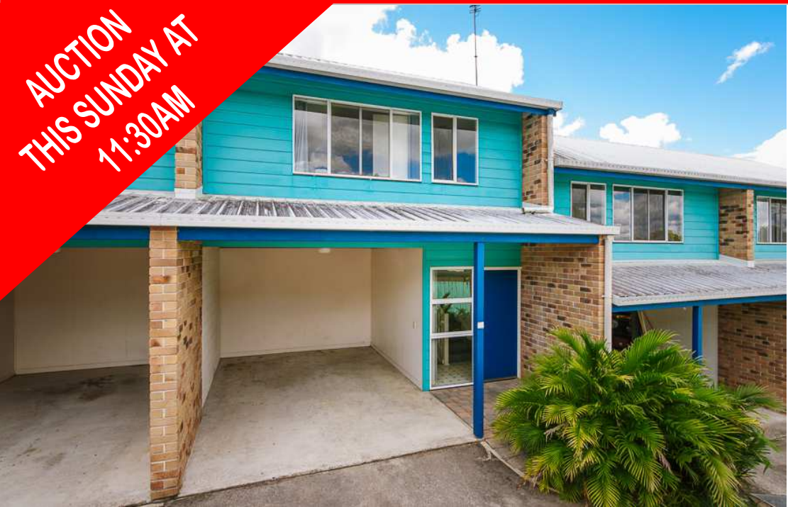
NAMBOUR - 2/8 Solandra Street AUCTION ON SITE 2nd OCTOBER at 11:30am