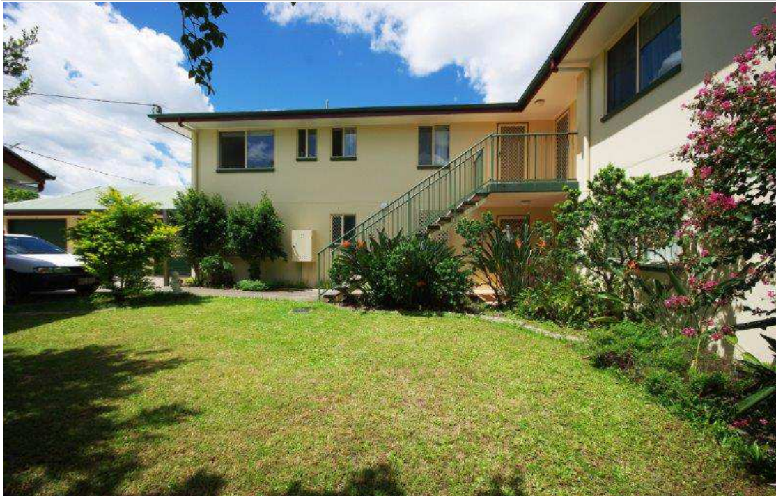
YANDINA—Units 3 & 6/4 Low St $245,000-$265,000 each