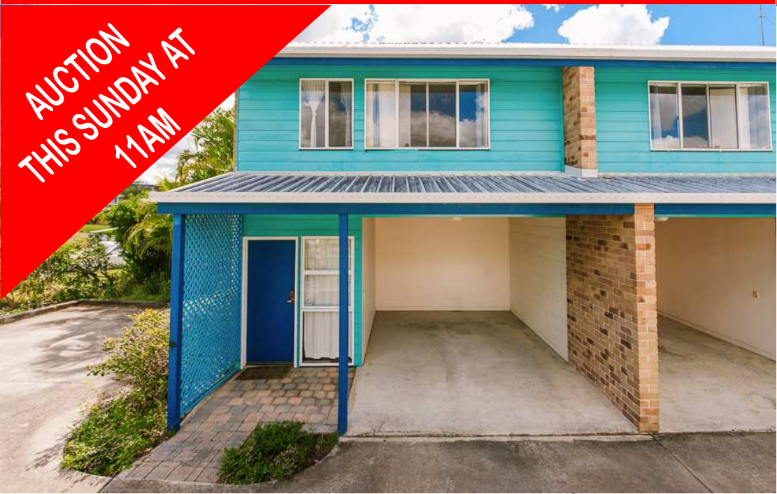
NAMBOUR—1/8 Solandra Street AUCTION ON SITE SUNDAY 2nd OCTOBER at 11am